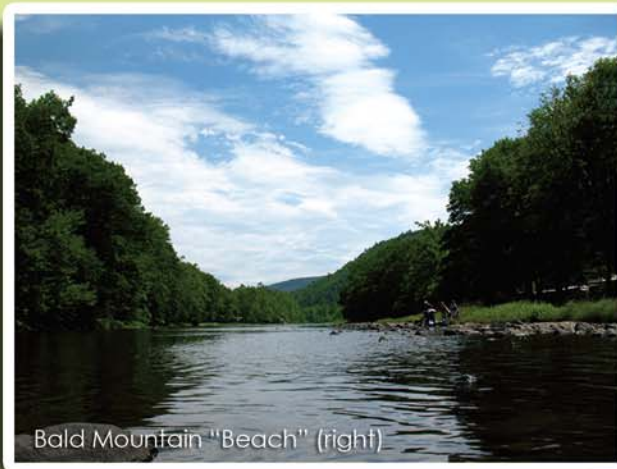
Bald Mountain "Beach" (right)

Bald Mountain has been family-owned and operated for over 40 years, and we take pride in operating a clean, quiet, and friendly campground. Our amenities include restrooms, showers, dump station, laundromat, playground, volleyball, basketball, ping pong, horseshoes, picnic tables, and fireplaces.