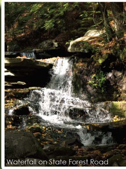
Waterfall on State Forest Road